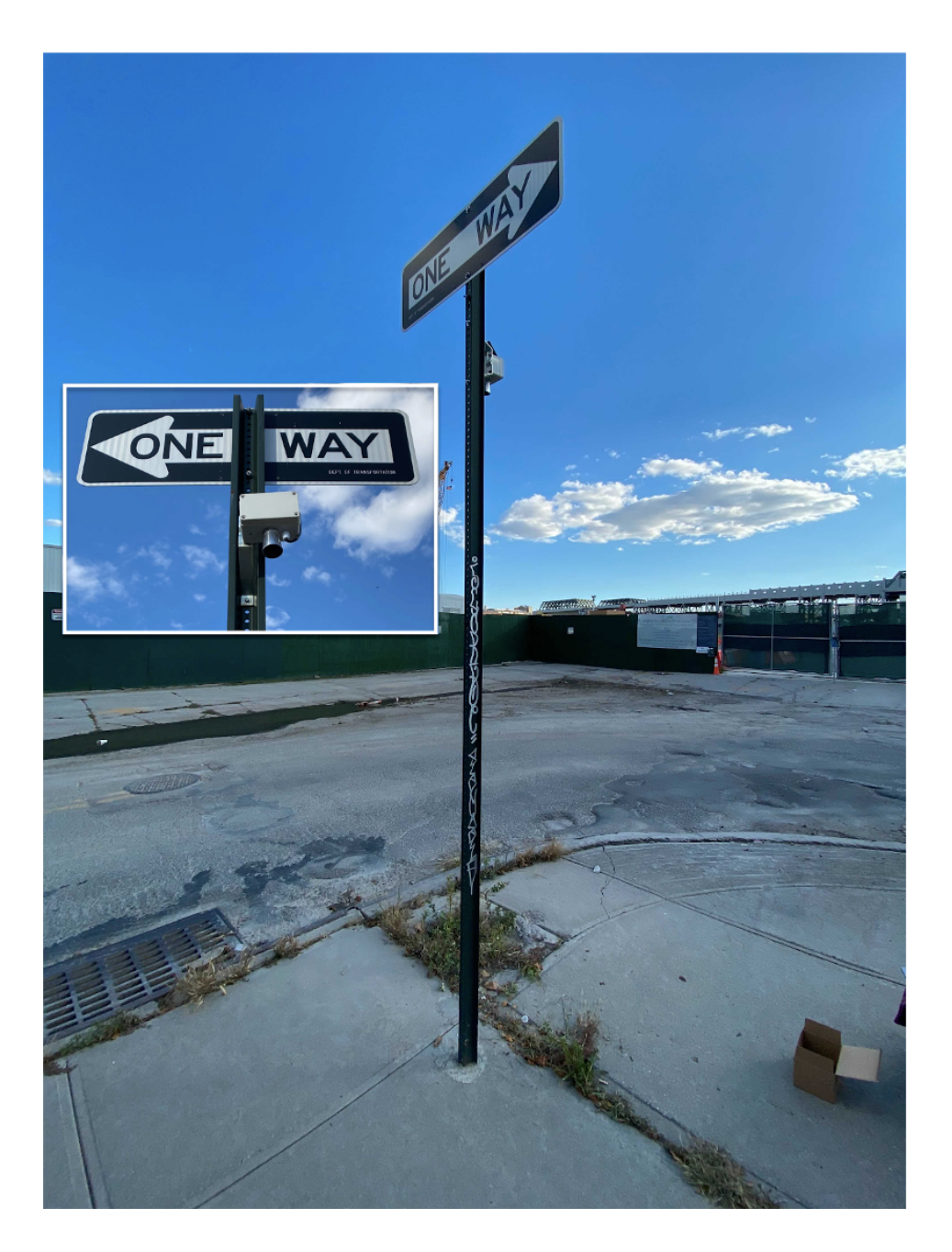
A FloodNet sensor deployed in Gowanus, Brooklyn.

The team plans to deploy additional sensors in other flood-prone neighborhoods in the coming months.