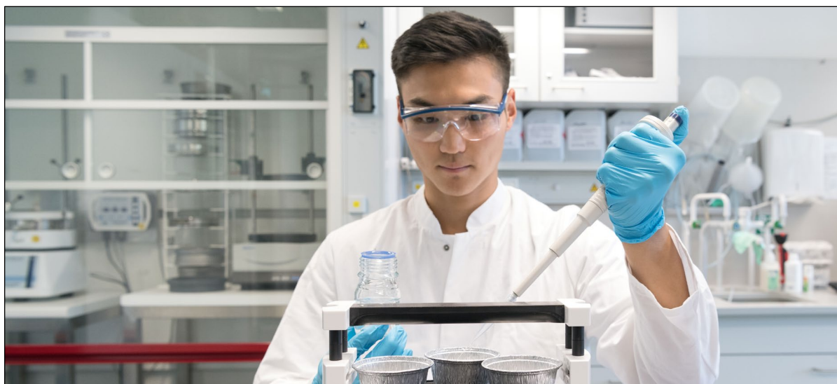
TUM PREP student in the lab