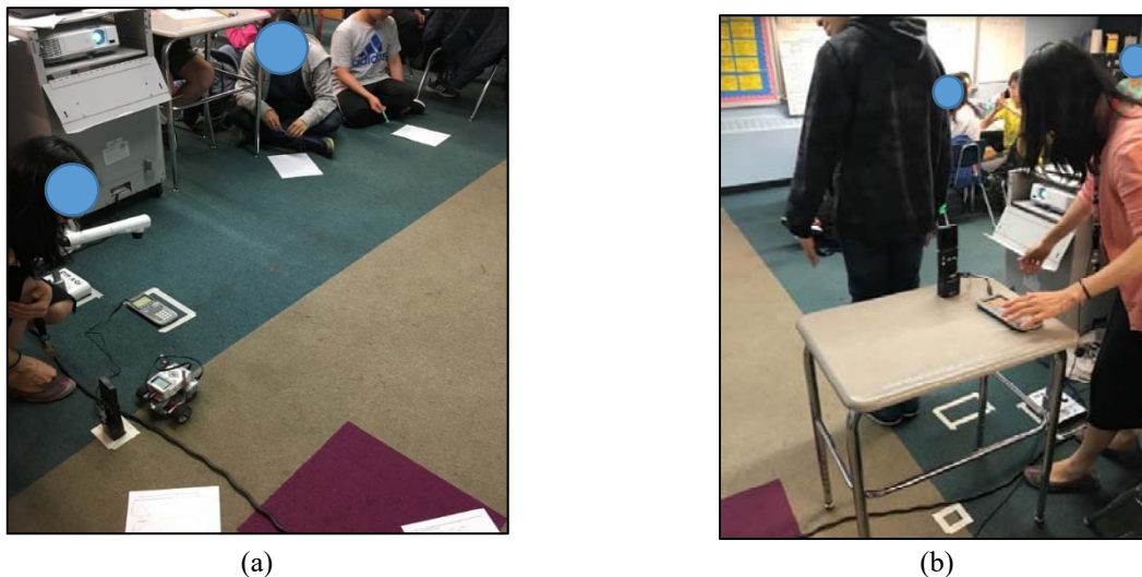
Figure 1: Classroom implementation of a math lesson using (a) robotics and (b) non-robotics activities.

performed a series of walking movements similar to the robot and the teacher instructed the students to identify the graph corresponding to each walking movement performed by the co-teacher and write a brief description about their findings. For the second activity, all the students in the class sat together as a group and a motion sensor was placed in front of the class. Now, as the co-teacher performed the same series of walking movements as previously, the motion sensor captured the movements and displayed their graphical representations on the screen. Next, all students were tasked with comparing the graphical outputs obtained using the motion sensor with their previous predictions and determine if their predictions were correct. Figure 1(b) shows the non-robotics activity lesson implementation in the classroom.